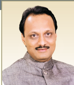
Hon. Ajit Pawar President

Deputy Chief Minister, Maharashtra State